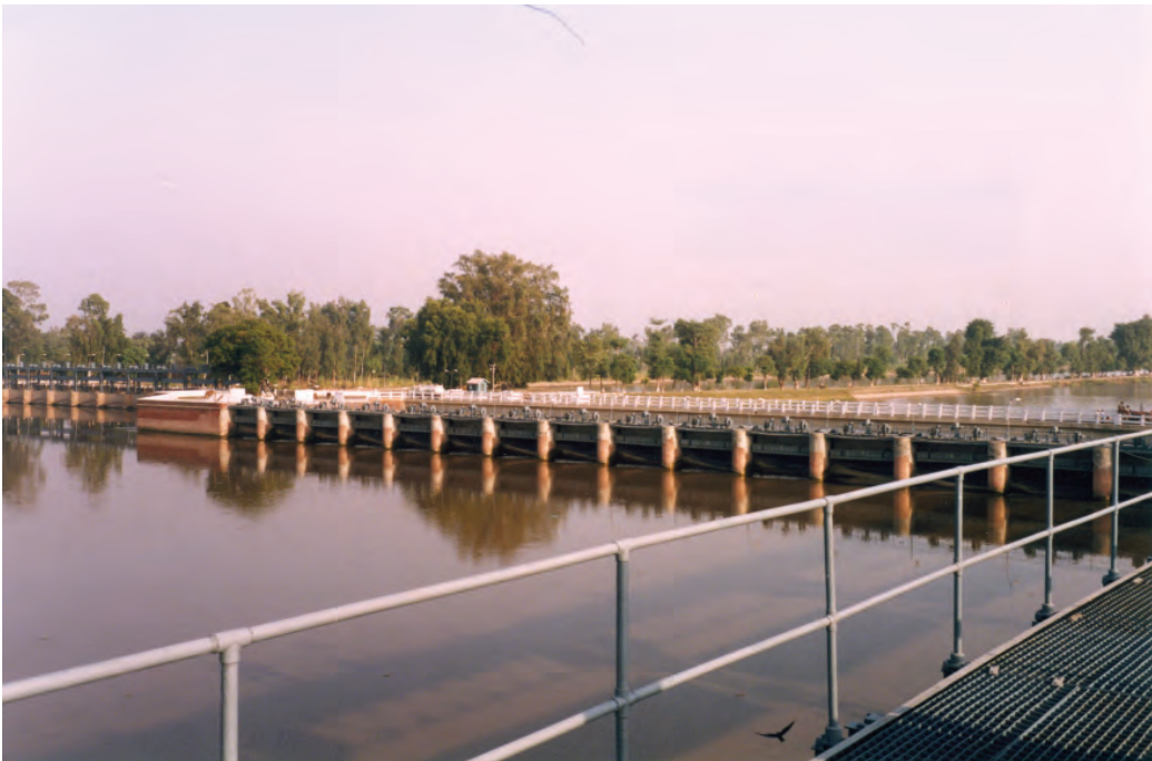
Photograph B for Question 1