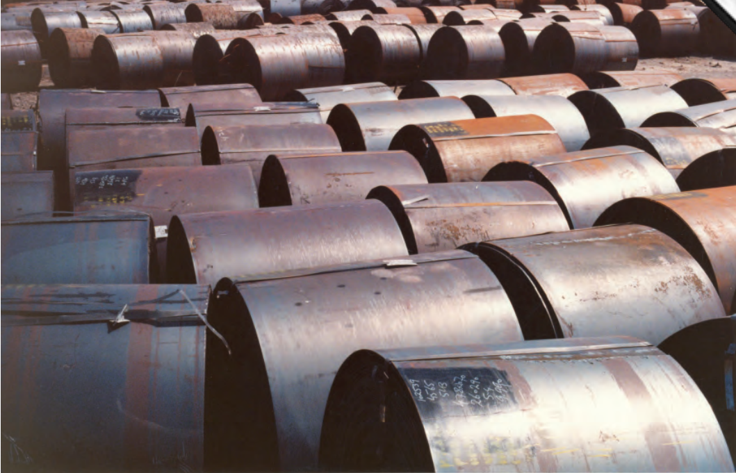
Photograph E for Question 4