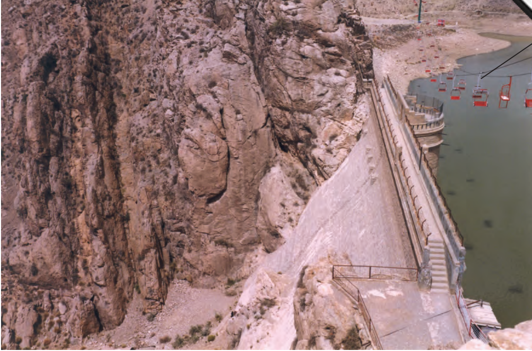
Photograph A for Question 1