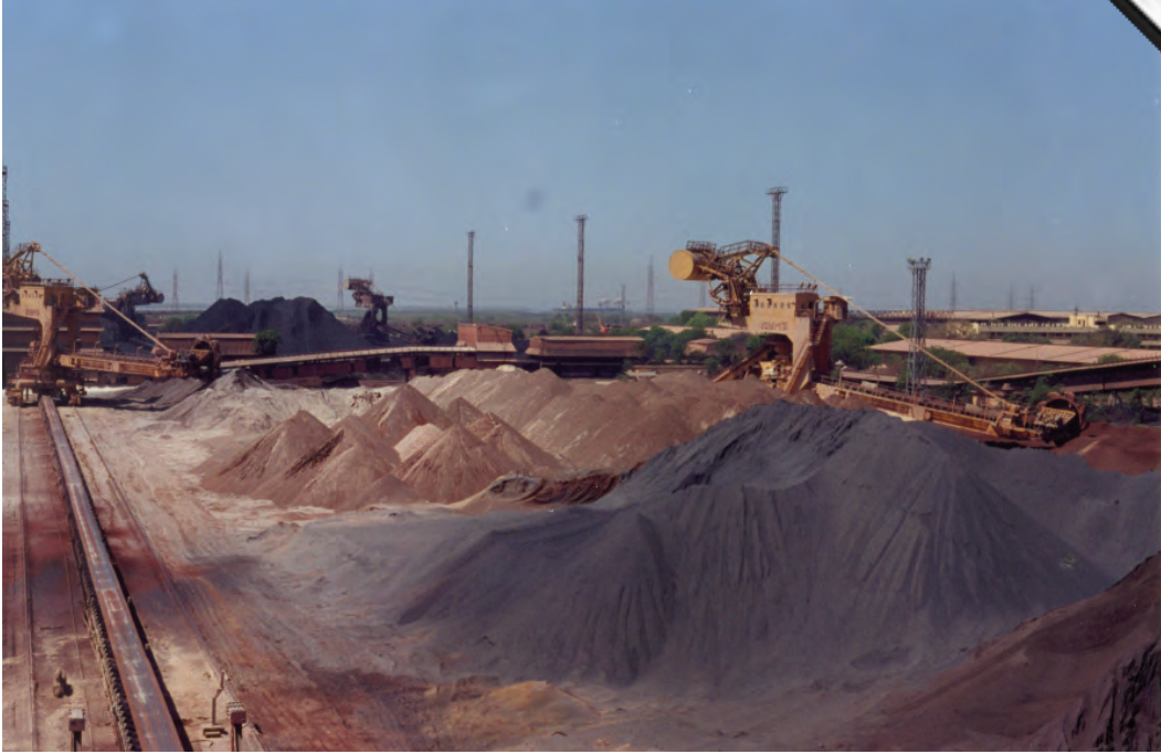
Photograph C for Question 4